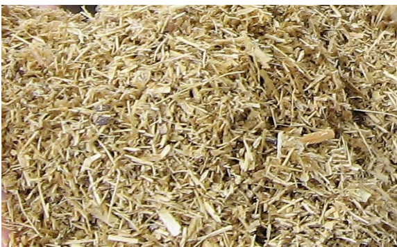
NUFIBER 3X BEFORE ABSORPTION