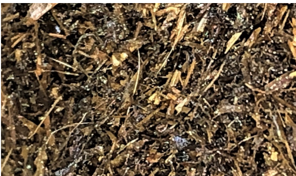
NUFIBER 3X AFTER ABSORPTION